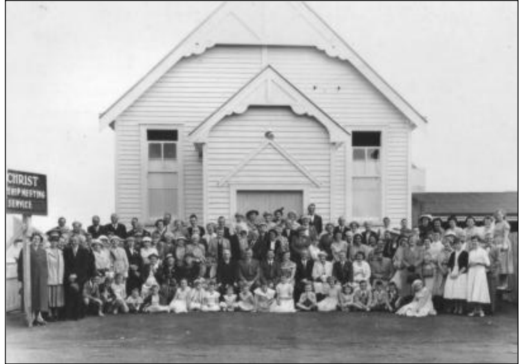
Above: 75th Anniversary Celebrations at the Sealey Street building—1957 Below: 100th Anniversary Celebrations at the Parawai Road building—1982